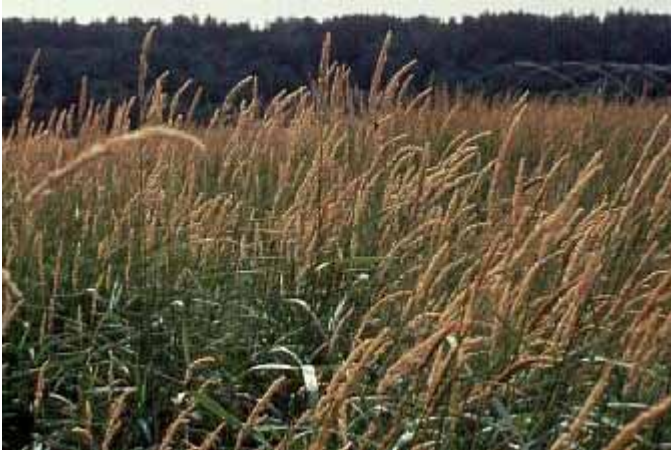
Field of Reed Canarygrass