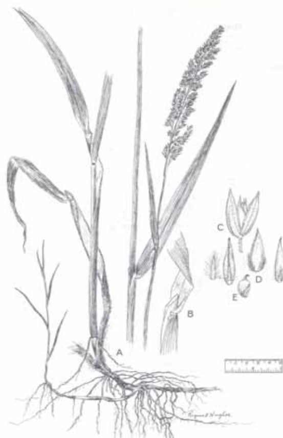
Phalaris arundinacea L. Reed Canarygrass. A, Habit-X 0.5; B, ligule-X 1.5; C, spikelet-X 5; D, florets-X5; E, caryopsis-X5.

Response to Mechanical Methods Heavy equipment has been used unsuccessfully in reed canarygrass removal. Rapid regrowth occurs from rhizomes and seeds that remain in the soil even after mechanical removal. Clipping back plants at ground level and covering them with opaque black plastic tarps can reduce but not eliminate populations (Apfelbaum and Sams 1987). However, this method is not always effective because reed canarygrass shoots can grow up through most materials, and seasonal inundation may displace covering materials (Gillespie and Murn 1992). Mowing may be a valuable control method, since it removes seed heads before seed maturation and exposes the ground to light, which promotes the growth of native species. Studies in Wisconsin indicated that twice-yearly mowings (in early to mid-June and early October) led to increased numbers of native species in comparison to reed canarygrass-infested plots that were not mowed (Gillespie and Murn 1992).