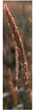
Seedhead of Reed Canarygrass

At the March 11, 2008, meeting of the West Virginia Invasive Species Working Group Meeting, it was announced that Reed Canarygrass has been added to Garlic Mustard, Japanese Stiltgrass and Ailanthus to form a list of the 4 exotic plant species most disruptive of natural ecosystems, especially as invaders of timber harvest areas in West Virginia.